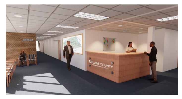
Architects' Concept of the Reception Area of the New Milam County Government Center